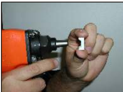
Position Tie Mount on the Air tool

Install Tack-Mounts with TwinMag driver ( No. 326 ). Tack-Mounts are sold in packages of 100 pieces. (No. 20427)