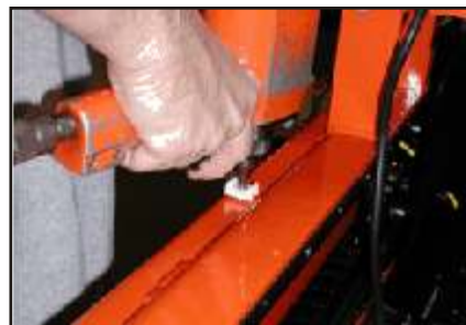
Fasten in one operation. No drilling or surface preparation.